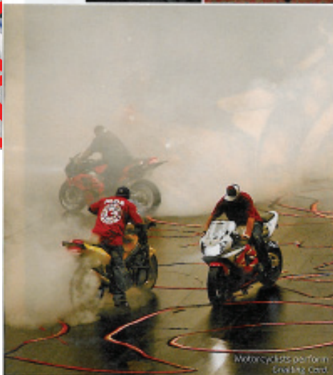
Motorcyclists perform a stunt on a wet street.