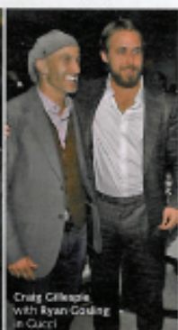
Craig Gillespie with Ryan Gosling in Gurd