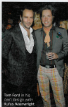
Tom Ford in his own design with Rufus Wainwright

"I've come a long way from Springfield, Ohio," said Legend.