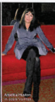
Anjelica Huston in Louis Vuitton