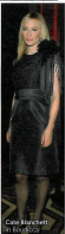
Cara Blanchett in Bouché