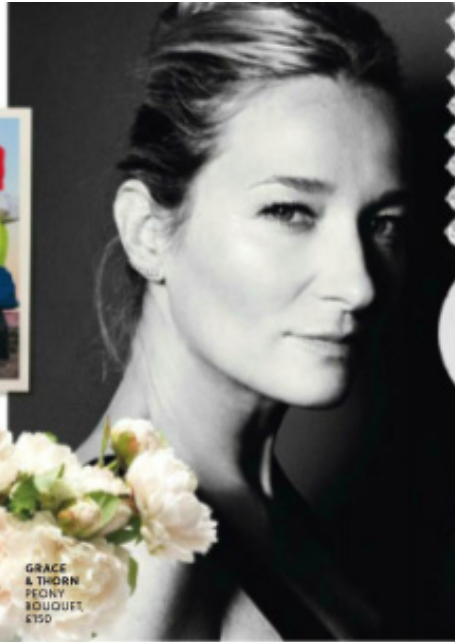
JULIETTE PARIS DIAMOND EARRINGS, FROM $19,210

I can't wait to see Ugo Rondinone's new exhibition in the Nevada desert (above)