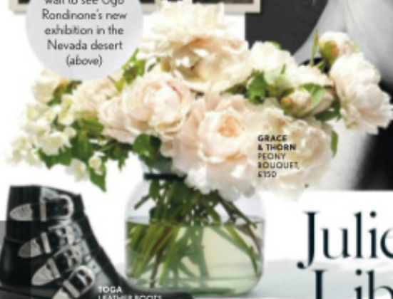
GRACE & THORN FEOLY BOUQUET $150