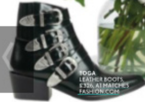
TOGA LEATHER BOOTS, $336. AT MATCHES FASHION.COM